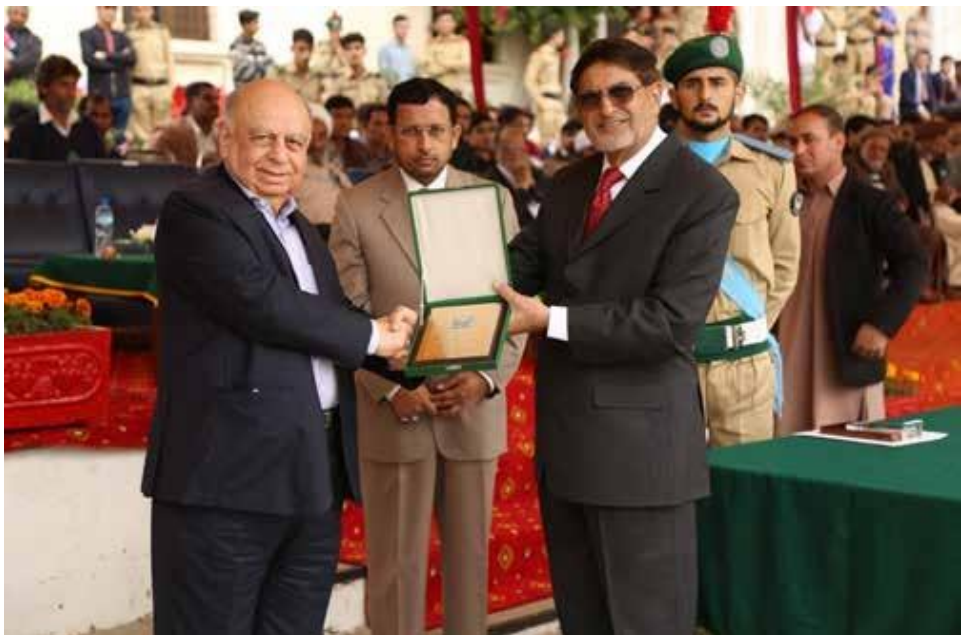
The Principal presenting College Shield to the Chief Guest