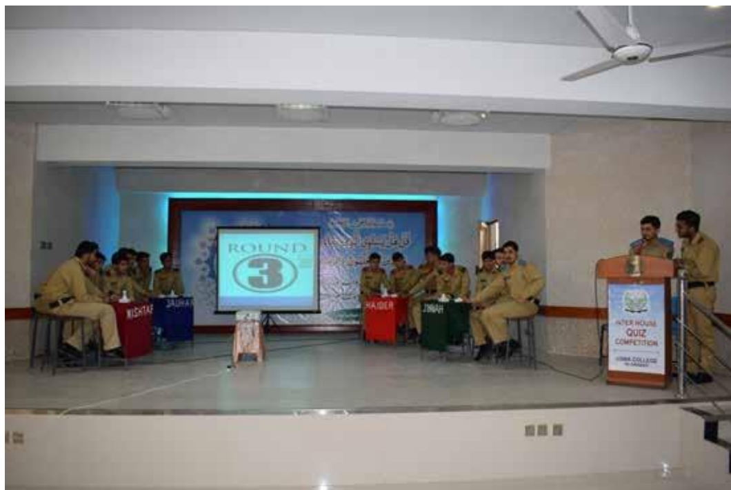
Inter House Quiz Competition