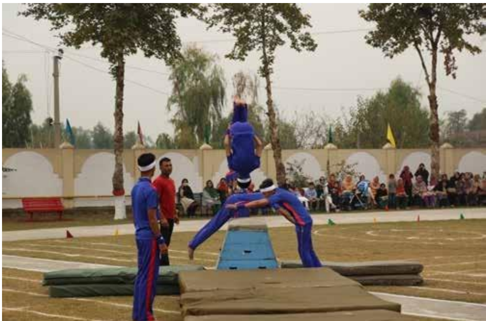
A thrill in Gymnastics