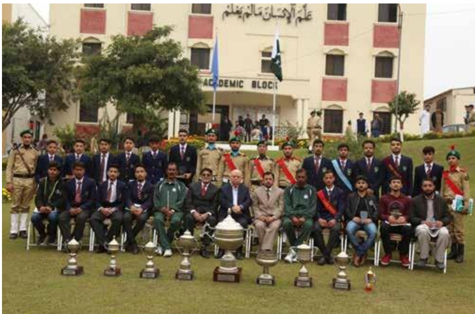
Prize Holders with Chief Guest