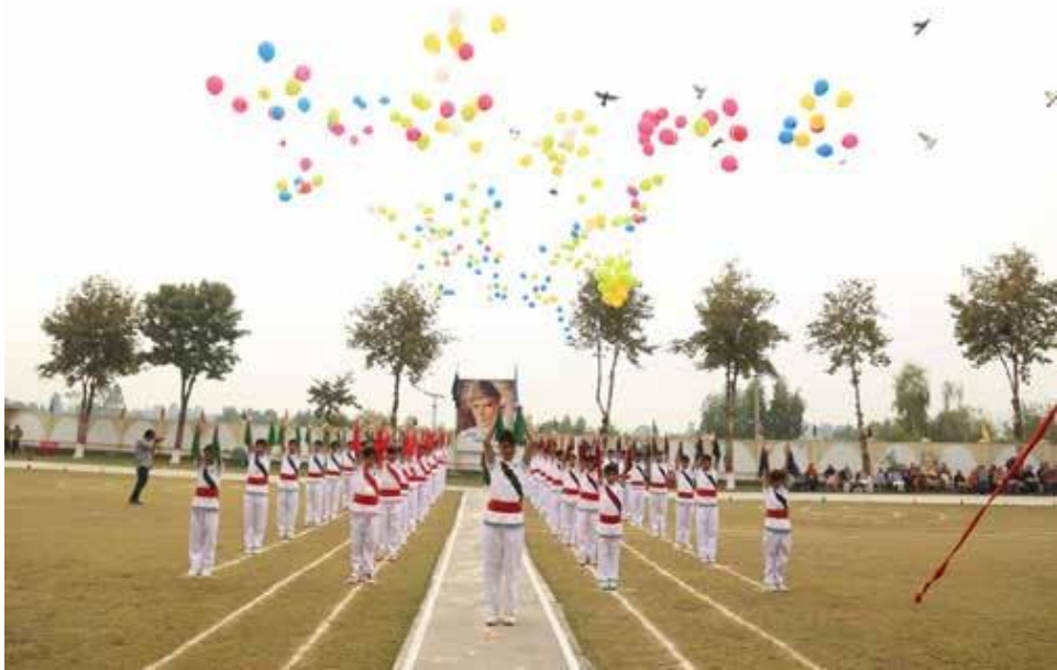
P.T.Display on the Parents Day