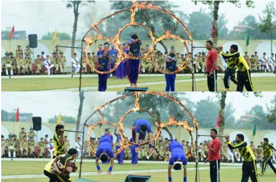
Dive through the Fire Ring