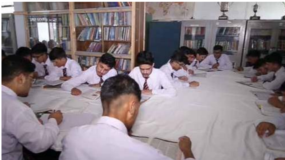
A View of College Library