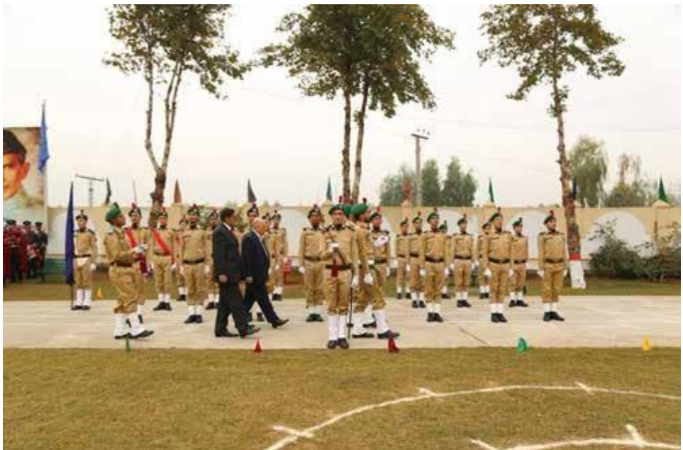
Parade Inspection by the Chief Guest