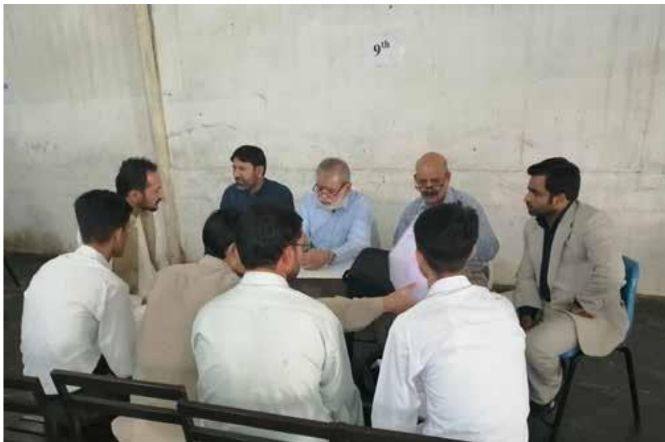
Parents Teacher Meeting