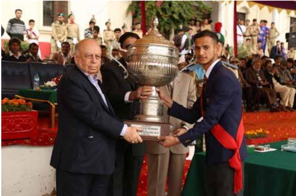
House Prefect Haider House Receiving Champion's Trophy from the Chief Guest