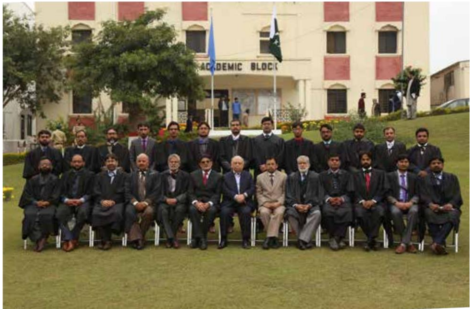
Faculty members with the Chief Guest