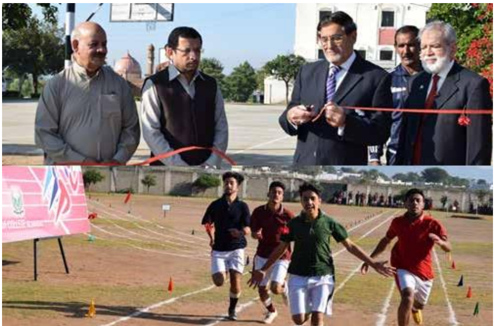
Race during Athletics Meet