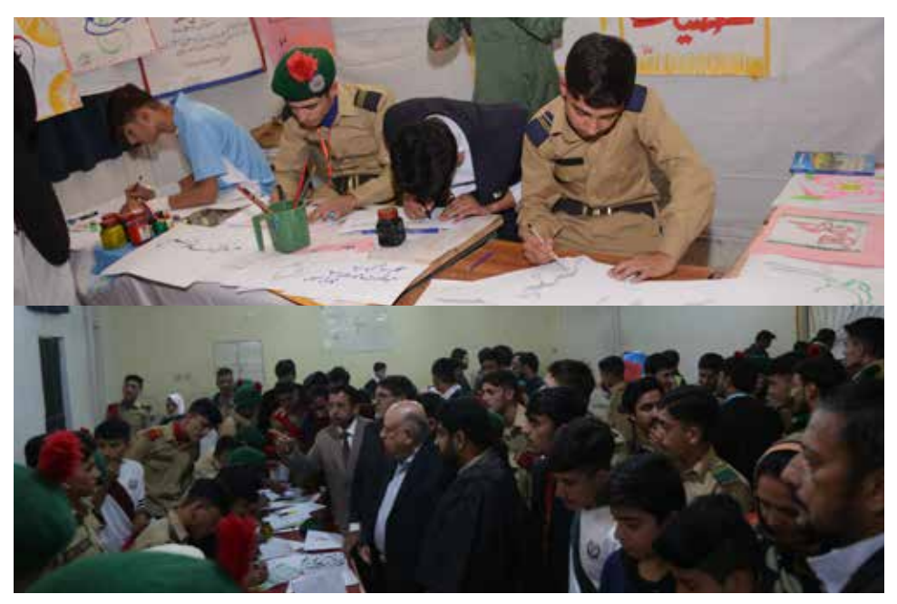
Calligraphy stall in Science & Arts Exhibition