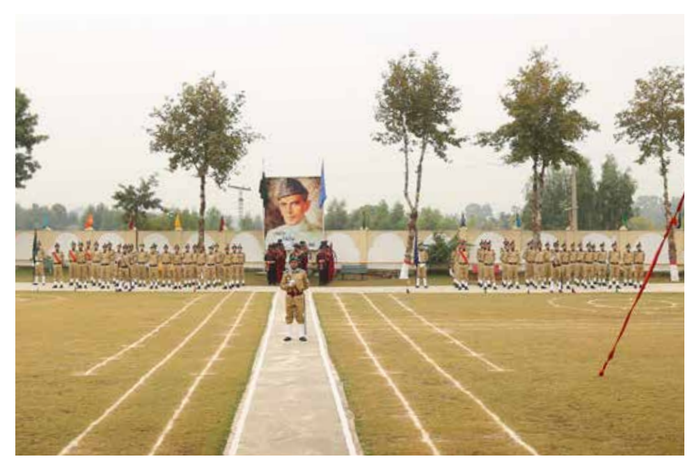
A view of parade on Parents Day