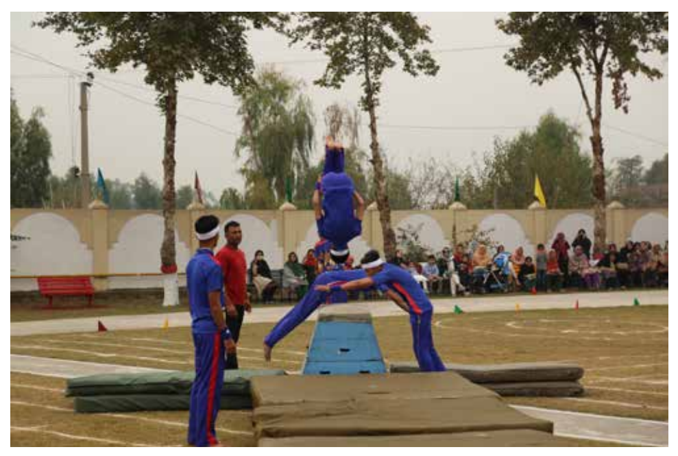
A thrill in Gymnastics