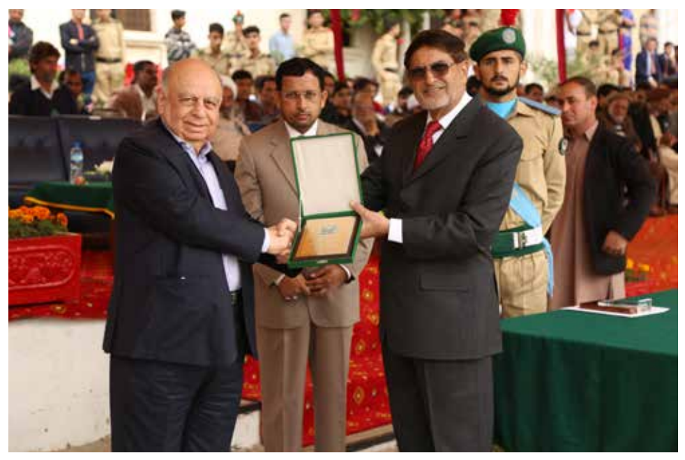
The Principal presenting College Shield to the Chief Guest

House Prefect Haider House Receiving Champion's Trophy from the Chief Guest