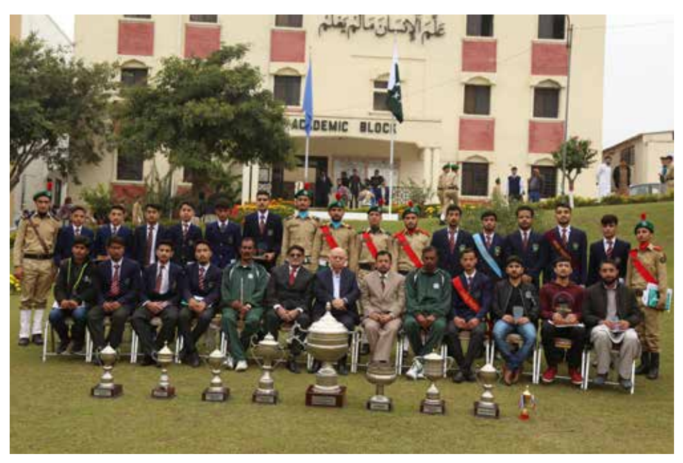
Prize Holders with Chief Guest