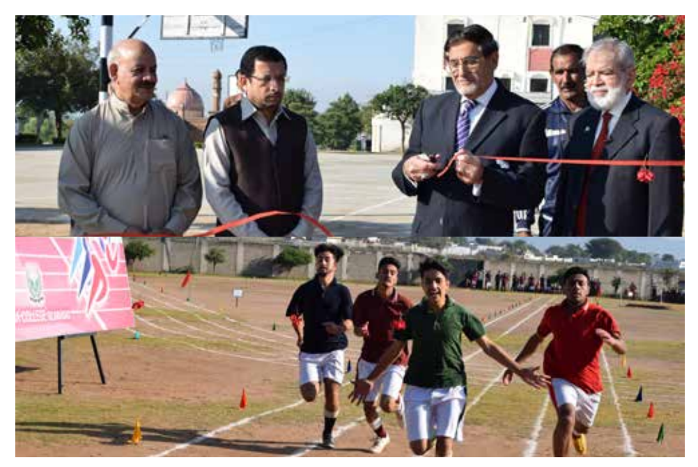
Race during Athletics Meet