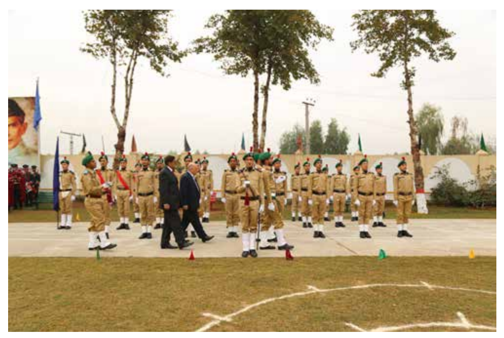
Parade Inspection by the Chief Guest