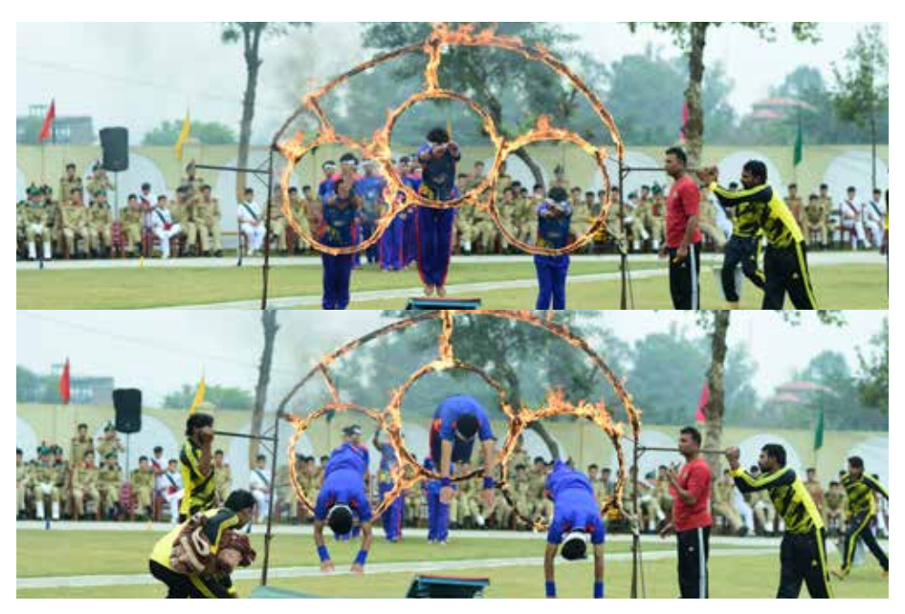
Dive through the Fire Ring