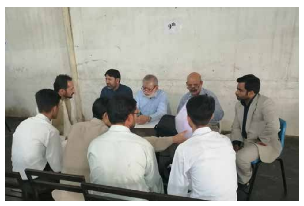
Parents Teacher Meeting