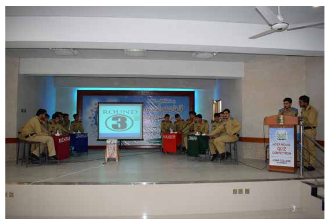
Inter House Quiz Competition