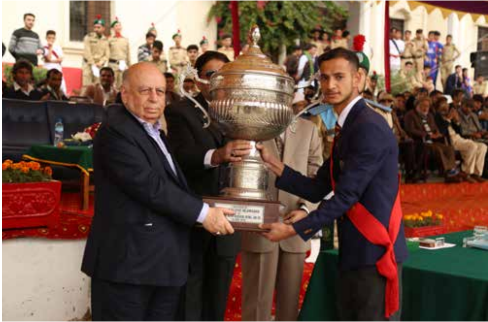
House Prefect Haider House Receiving Champion's Trophy from the Chief Guest