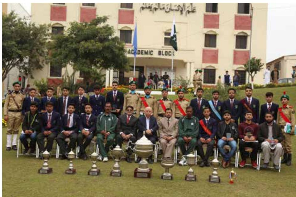
Prize Holders with Chief Guest