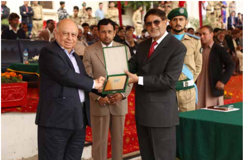
The Principal presenting College Shield to the Chief Guest