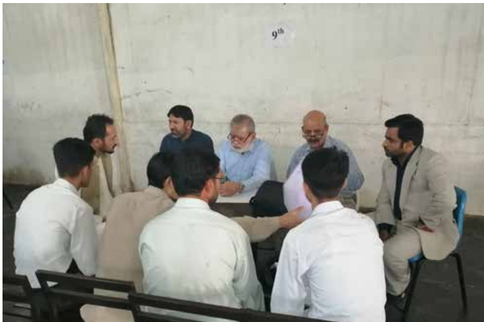
Parents Teacher Meeting