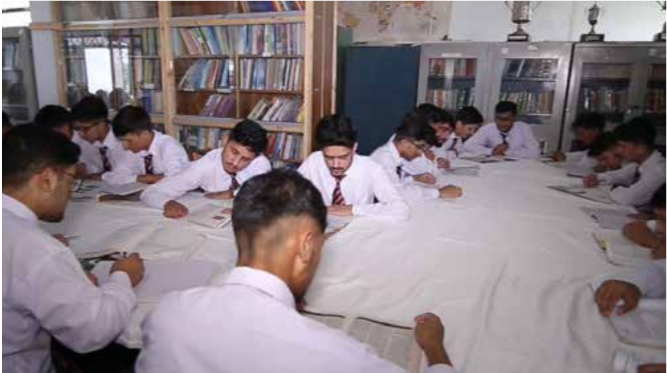
A View of College Library