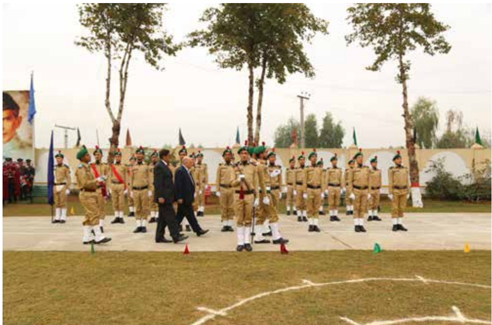
Parade Inspection by the Chief Guest