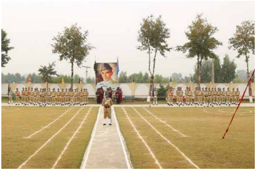
A view of parade on Parents Day