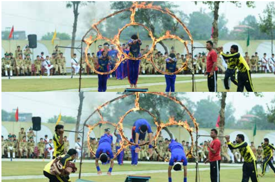
Dive through the Fire Ring