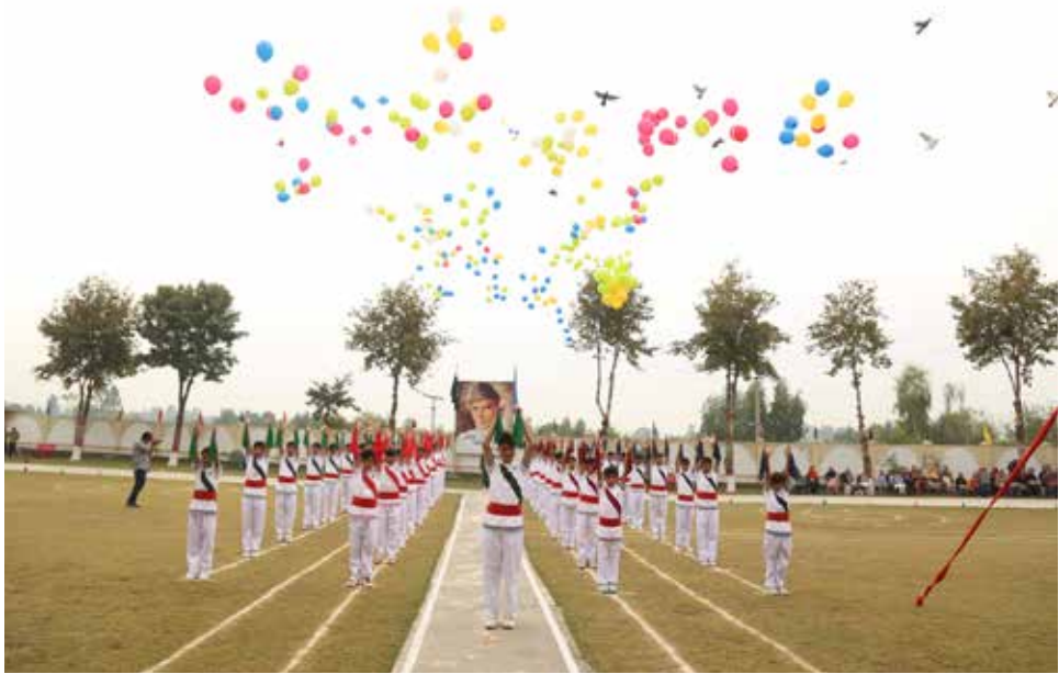
P.T.Display on the Parents Day