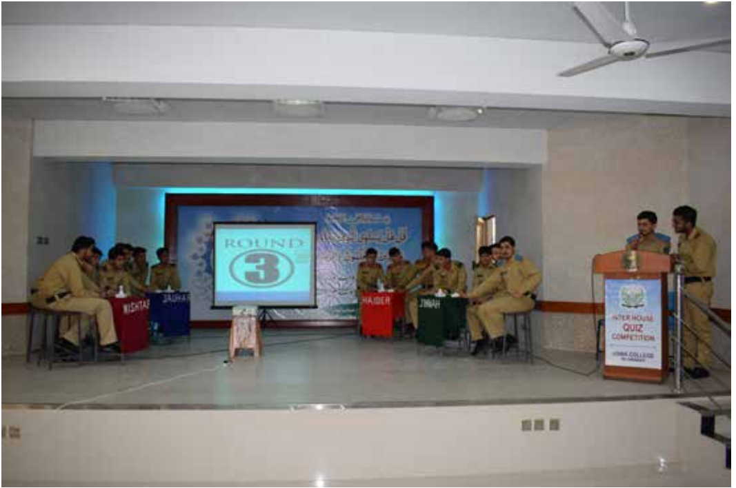
Inter House Quiz Competition