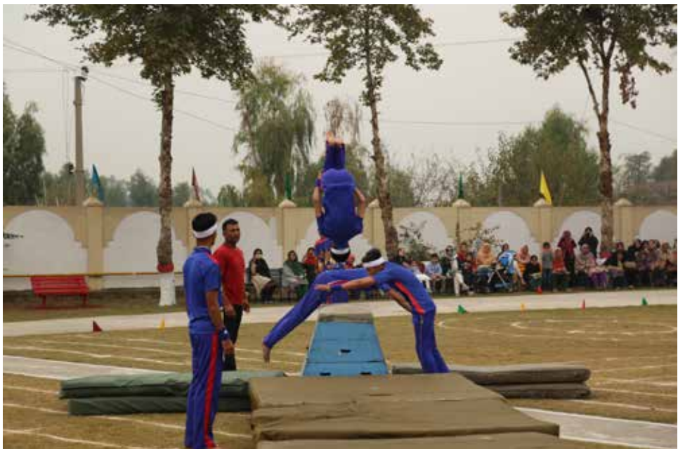
A thrill in Gymnastics