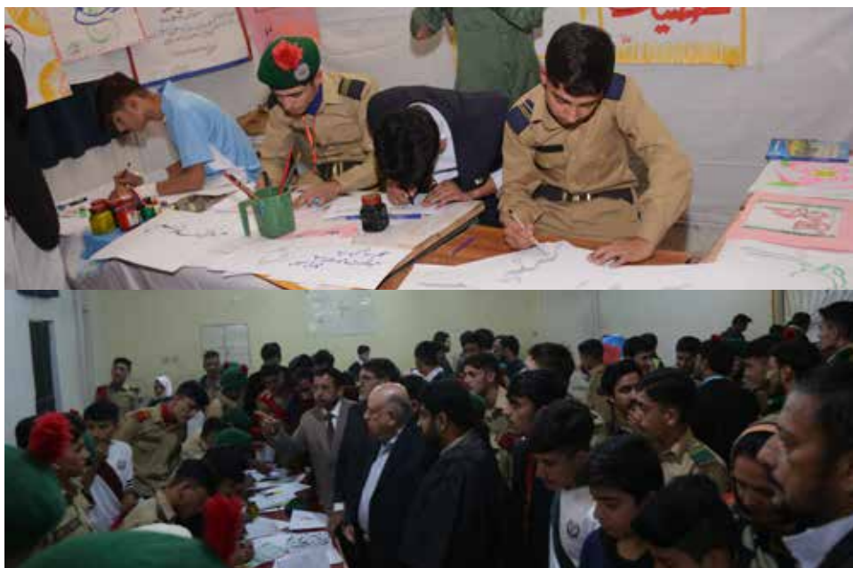
Calligraphy stall in Science & Arts Exhibition