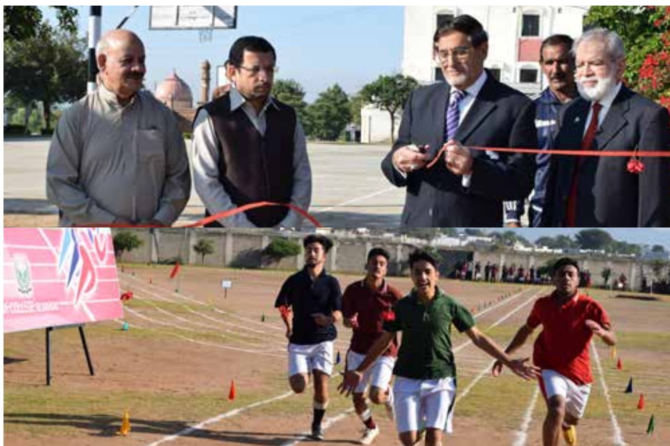
Race during Athletics Meet