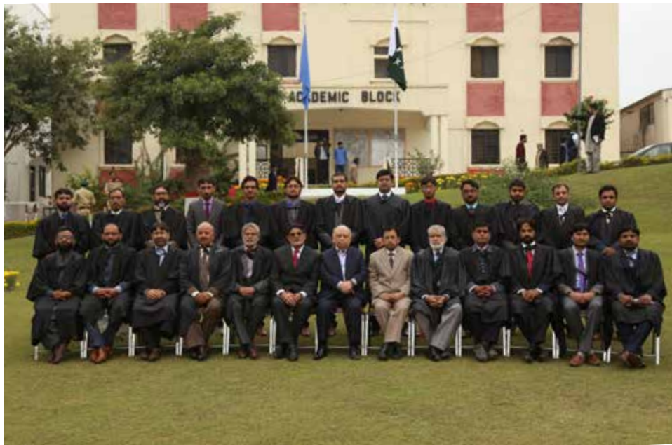
Faculty members with the Chief Guest