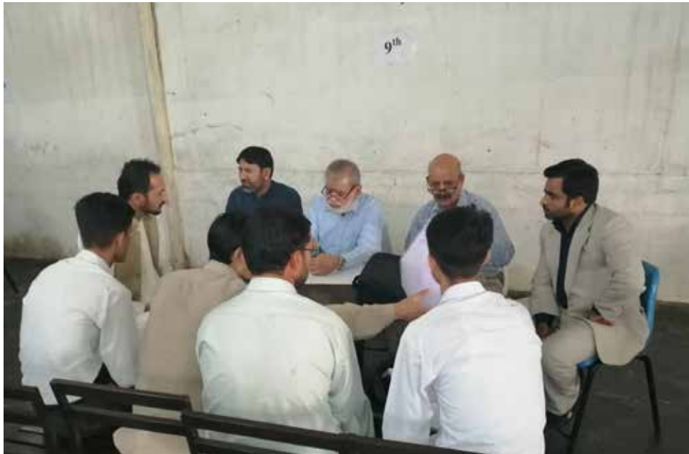
Parents Teacher Meeting