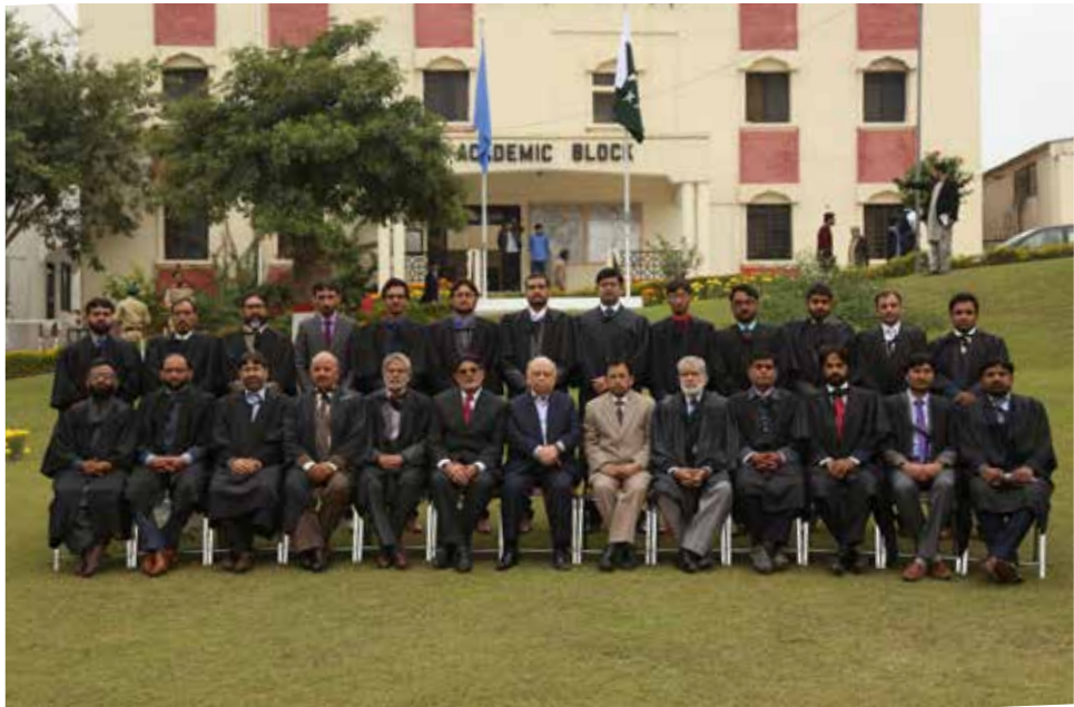
Faculty members with the Chief Guest