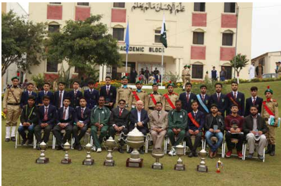
Prize Holders with Chief Guest